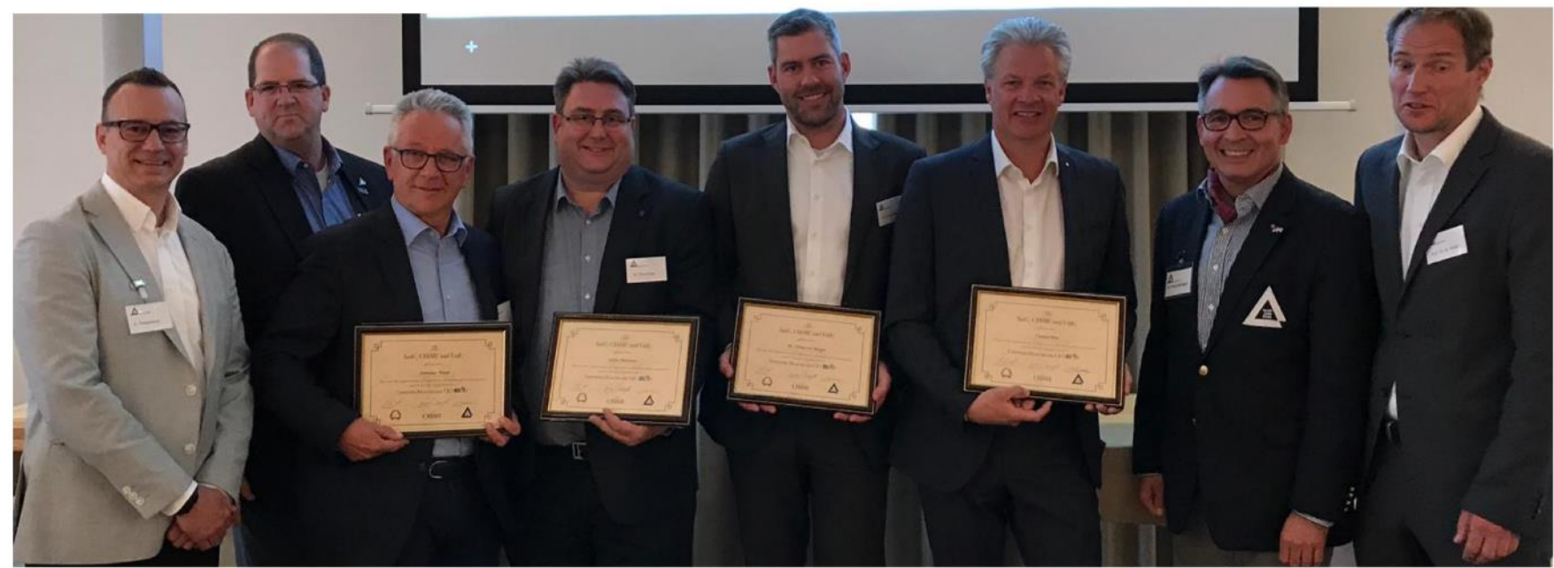
Die ersten deutschsprachigen „Certified Healthcare CIOs“ wurden auf dem Kongress „Krankenhausführung und digitale Transformation“ ausgezeichnet.